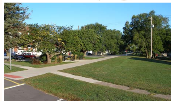
above: completed trail through Dallas Center