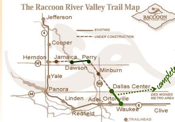
The Raccoon River Valley Trail Map

In recent years, the Conservation Board directors have estimated that more than 125,000 people per year are using the RRVT. With the connection into the metro trail system now completed in Des Moines, as well as the new North Loop being completed on the RRVT, the number of users is expected to mushroom in the years ahead. The Dallas County Conservation Board and the cities of Dallas Center and Waukee are excited for the opportunities created by the recently completed 5.5 mile segment linking these two active communities!