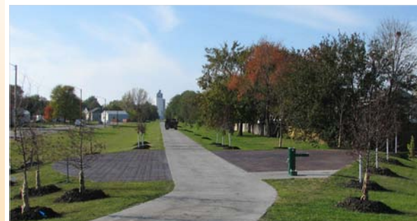
above: completed trail through Waukee